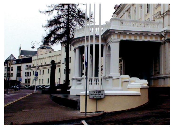
Location: Totorių St. 25, LT-01121 Vilnius, Lithuania.

The Conference will take place in the Ministry of National Defence of the Republic of Lithuania, ORŠA hall on 15-16 September 2022.